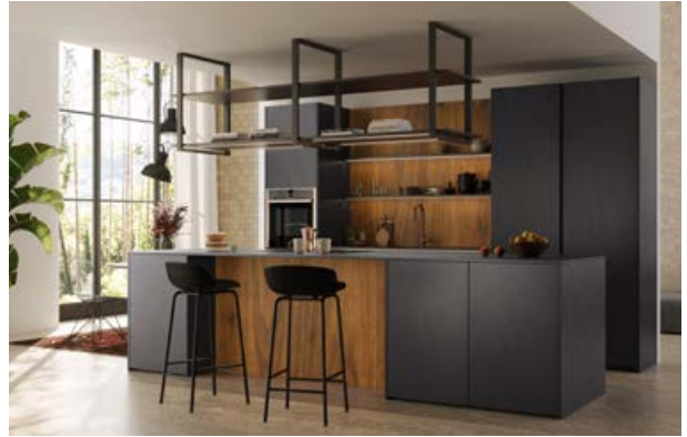
"Zerox KQ" plastic front in "Textured Carbon Stone", combined with the "Memory RI" real wood range (veneer) in "Walnut" with vertical wood grain and narrow slatted look. Special feature of this plan: full seamless edge (front 1) in the front colour.