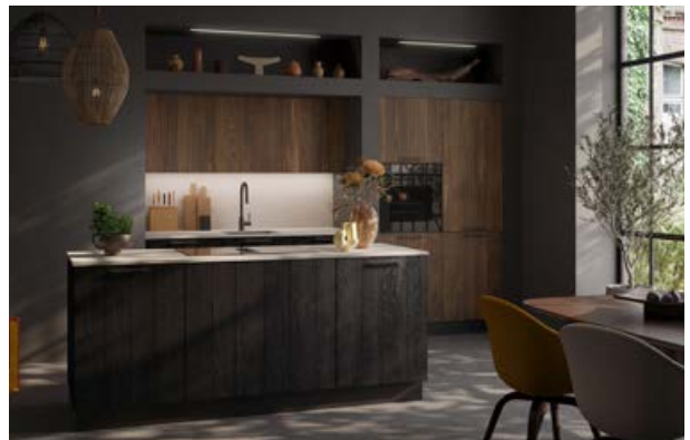
"Zerox SY VER" plastic front with either horizontal or vertical oak texture (NB), shown here in the colour "Timber Black", combined with the "Zerox FM" plastic cabinet front range in "Ripasso Dark oak" (new). Special feature of this plan: Cabinet fronts with full seamless edge.