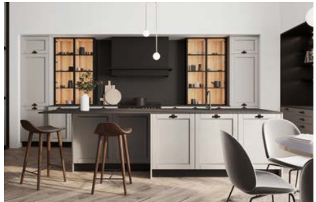
"Ergo FL Zero" solid real oak framed cabinet fronts in the colour "Beach Grey", with handles from Buster + Punch (new). Frame width: 80 mm.