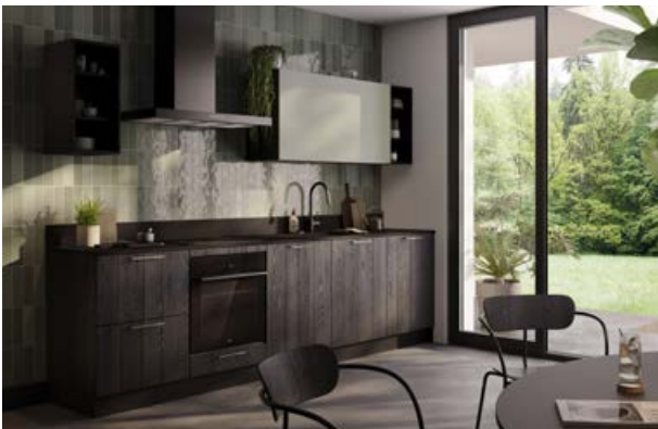
"Zerox SY VER" plastic front with either horizontal or vertical oak texture (NB), shown here in the colour "Timber Black", combined with matte UV direct coated surface "Zerox MA" (with anti-fingerprint technology) in "Tundra".