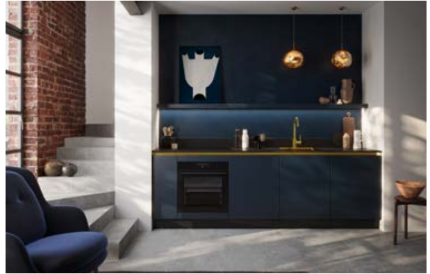
Matte UV direct coated surfaces: used with the "Zerox MA" plastic cabinet front range in "Midnight Blue". Other special features of this plan: rectangular recessed handles in "Aureo" gold shade, cabinet fronts with full seamless edge.