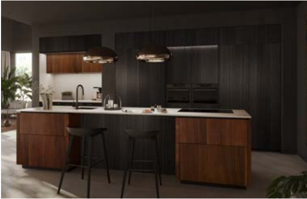
"Zerox SY VER" cabinet front with anti-fingerprint coating in "Loft Black Oak" (NB) with either horizontal or vertical wood texture, combined with the "Memory RI" real wood range (veneer) in "Walnut" with vertical wood grain and narrow slatted look.