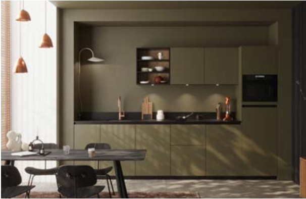
"Zerox FM" plastic front in "Olive Green" (new). Special features of this plan: Convenient lower cabinet height of 91 cm ("New Dimensions"); fronts with full seamless edge in the front colour.