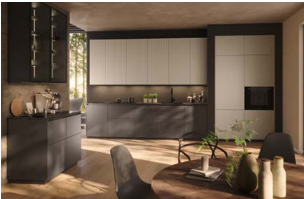
"Memory RI" real wood veneer in "Terra Grey" with anti-fingerprint coating, combined with the "Class VM" super matte glass laminate front in "Titanium". Other special features of this plan: "Terra Grey" is one of the two new solid colours for "Memory RI"; the glass laminate fronts have faceted edges.